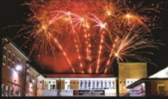
We provide a nurturing environment of love, respect and discipline, where every individual is highly valued and our care and concern for others is central to our mission.

Open Morning Tours are also available via Eventbrite: https://bit.ly/StRomerosTours2024 October 7th, 8th, 9th, 10th, & 15th at 9.15am